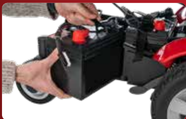
Side access to the battery

Active-Trac® Suspension ensures a smooth ride experience over uneven surfaces