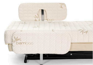
Optional Bed Rail and Bamboo Cover