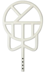
Halo Safety Ring Available for Install